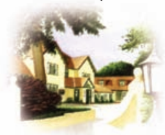
We are here